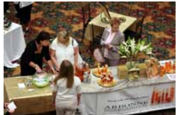
Volunteers help give information out as needed.